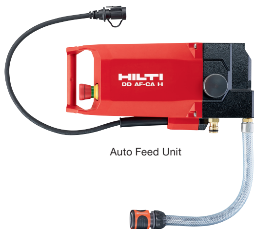
Auto Feed Unit